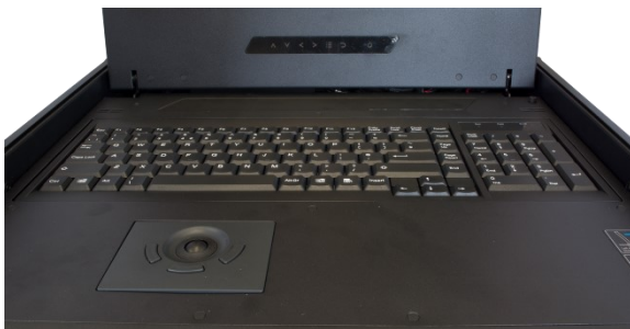
Example shows UK layout keyboard with trackball mouse, other supported layouts are displayed opposite

Available with a trackball mouse (shown) or a touchpad mouse.